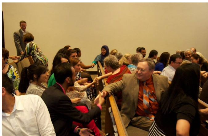
A special thanks to photographer Ozen Ahmed.