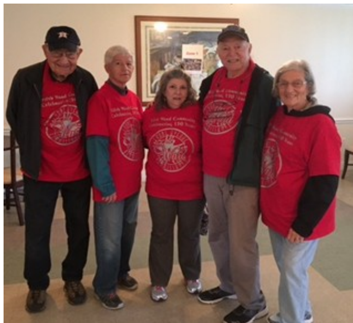
HCRJ's Social Action Committee volunteered at the Lyons Avenue Renaissance Festival in Houston's 5th Ward