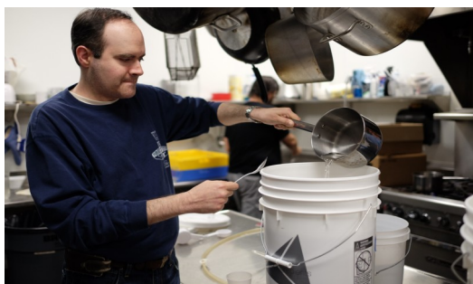
He-Brew