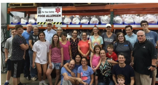
HCRJ Meals on Wheels in August 2016

Join us on Saturday, August 18, as we return to volunteer at the Meals on Wheels program at Interfaith Ministries for Greater Houston! We will be assembling weekly