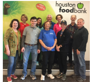
HCRJ volunteering at the Houston Food Bank on Saturday, January 6, 2018.